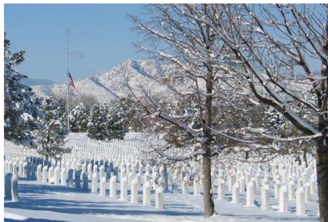
Fort Logan National Cemetery after a snowfall.