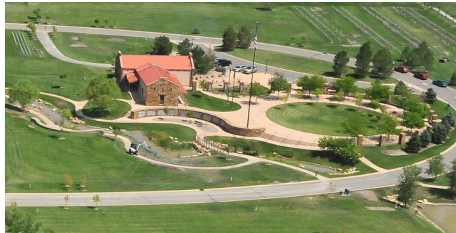
Veterans Memorial Cemetery of Western Colorado