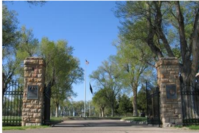
Front gate at Fort Lyon National Cemetery.